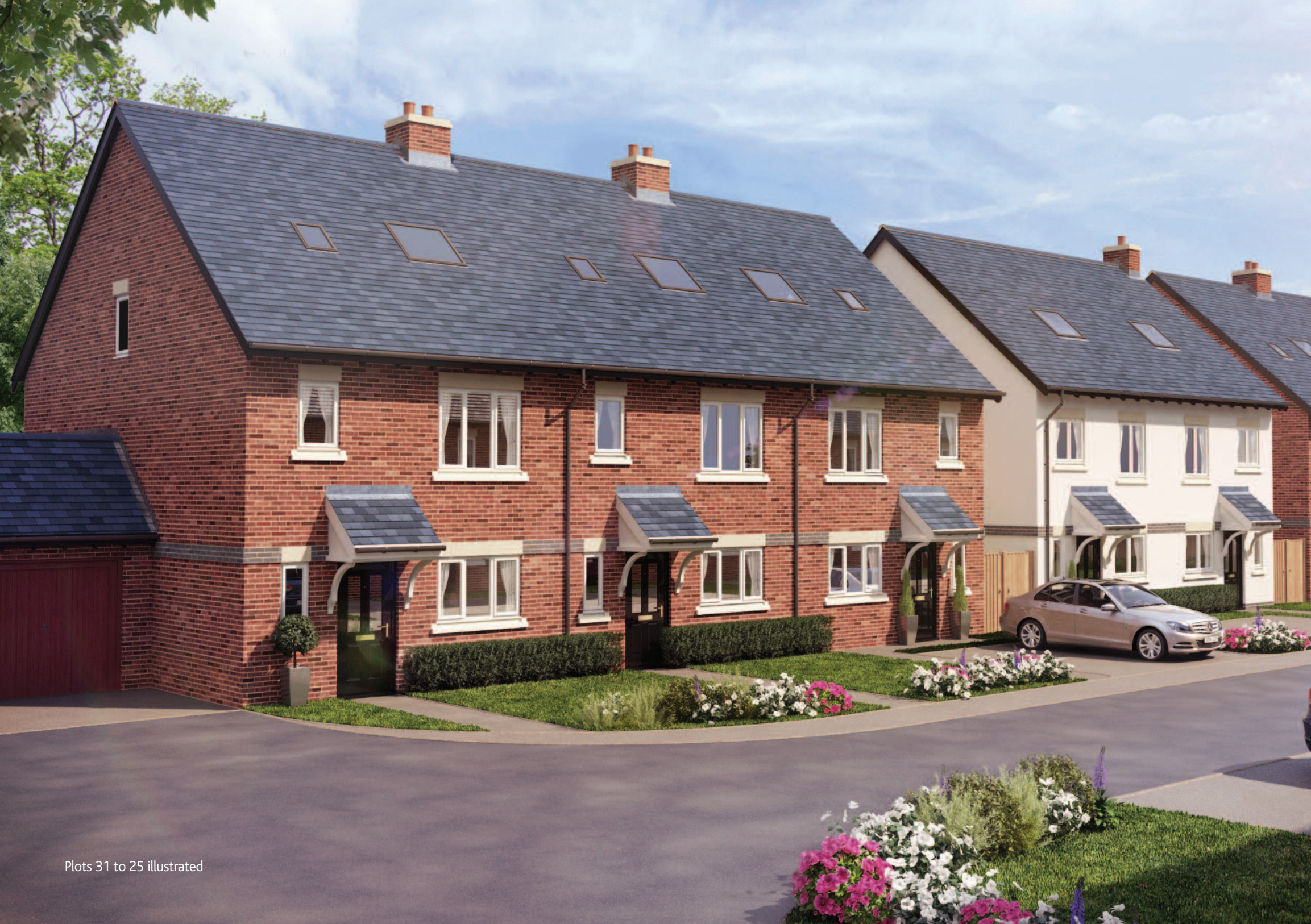
Plots 31 to 25 illustrated